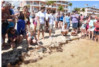
Head-Started Releases: A Head-Started turtle raised fully at CTCEC is released. These turtles are from clutches laid on our breeding beach located in the Centre and hatched in our hatchery. They are then raised under the care of our two full-time veterinarians for at least one full year prior to their release. Each turtle undergoes testing and quarantine protocols prior to their release for health and safety.

The other popular program for our releases that is well known is the Head-Start releases of the juvenile sea turtles aged one year or more, into the sea from beaches around our islands. CTC also offers this to guests as a privately sponsored turtle release opportunity to share with their family, friends or colleagues, to mark a special occasion or as a corporate team building event.